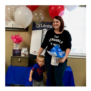
CAPTION GOES HERE

Heart disease is the leading cause of death for both men and women in the United States. The good news? It is also one of the most preventable. Making heart-healthy choices, knowing your family health history and the risk factors for heart disease, having regular check-ups and working with your physician to manage your health are all integral aspects of saving lives from this often silent killer.