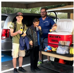
Donut Stress about it Monday

We are working on setting up special notification groups for our residents in an effort to ensure that you get only the information you want and we would appreciate your participation and feedback when the forms are sent out later this week.