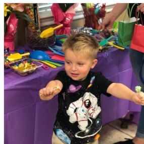
Willie Wonka Wednesday