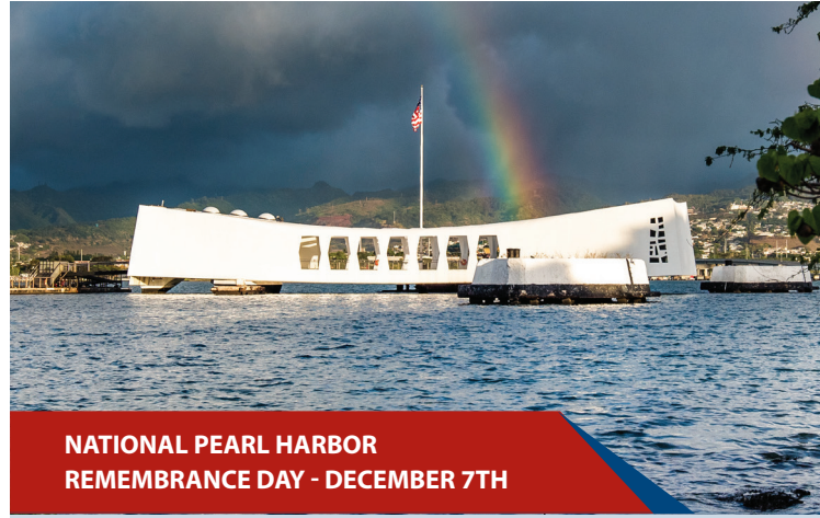
NATIONAL PEARL HARBOR REMEMBRANCE DAY - DECEMBER 7TH